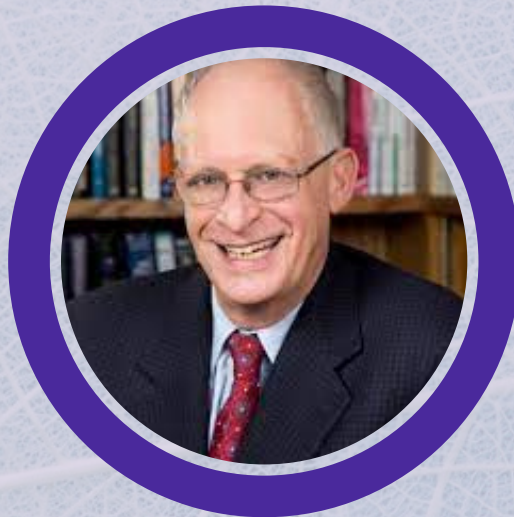
Prof. (Dr.) Oliver Hart

He is the recipient of the Sveriges Riksbank Prize in Economic Sciences in Memory of Alfred Nobel 2022 . He is Boatmen's Bancshares Professor of Banking and Finance at Olin Business School of Washington University, St. Louis.