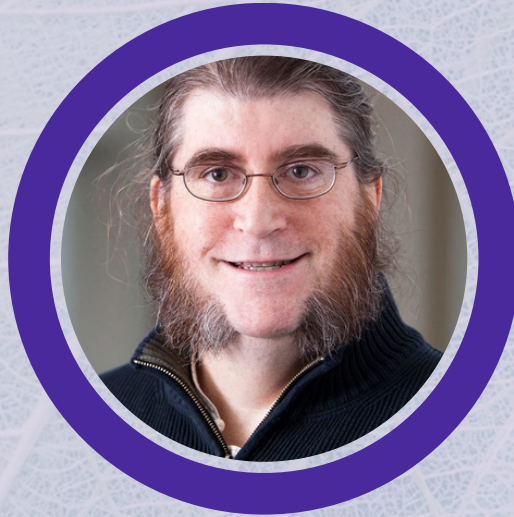
Prof. Philip H. Dybvig

He is the recipient of the Sveriges Riksbank Prize in Economic Sciences in Memory of Alfred Nobel 2022 . He is Boatmen's Bancshares Professor of Banking and Finance at Olin Business School of Washington University, St. Louis.