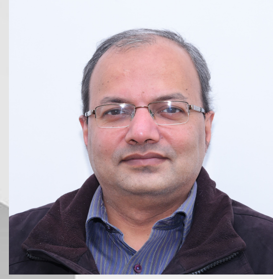
Keynote Speaker: Padma Shri Dr. Manindra Agrawal, Professor of the Computer Science and Engineering, Indian Institute of Technology, Kanpur.