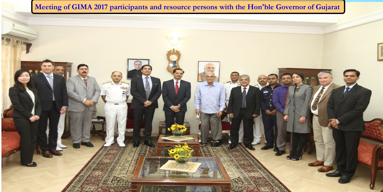
Meeting of GIMA 2017 participants and resource persons with the Hon'ble Governor of Gujarat

• Daily field/port/cultural and heritage visits.